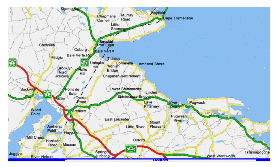
Map of the Chignecto Isthmus showing the main roads and communities. (Adapted from multi map online, 2005 AND Data Ireland, Ltd.)

The Chignecto Isthmus is the narrow stretch of land that joins the province of Nova Scotia to the province of New Brunswick and the North American continent. It contains extensive wetlands, woodlands, and coastal habitats, several cities and towns and major transportation routes.